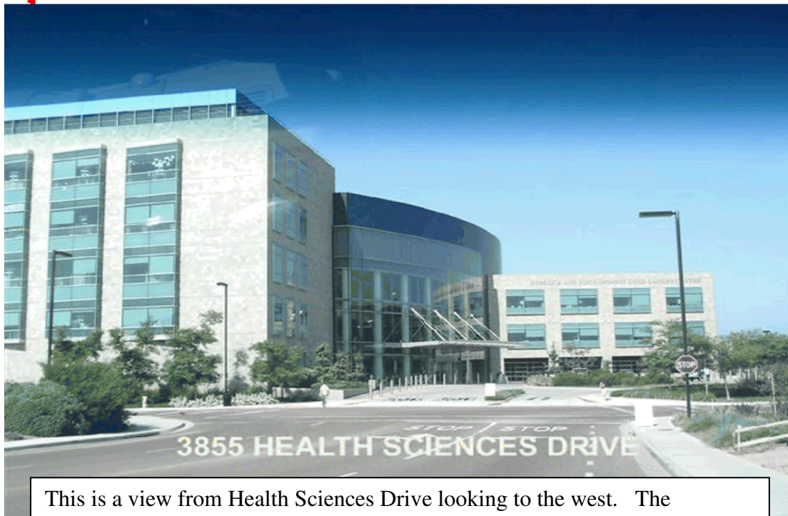
This is a view from Health Sciences Drive looking to the west. The passenger drop off is straight ahead. Park in lot #2 on the left of the picture.

The White X in the Black Box is Moores Cancer Center.